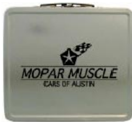
MMCA Lunchbox $15.99