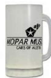
MMCA Frosted Mug Original Price $14.99