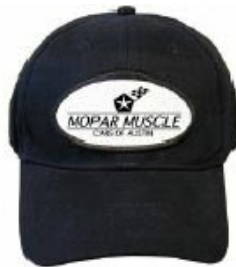
Black Cap $15.99