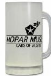
MMCA Frosted Mug Original Price $14.99