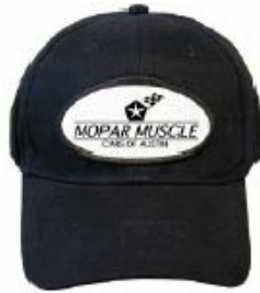
Black Cap $15.99