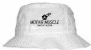
MMCA Beach Hat