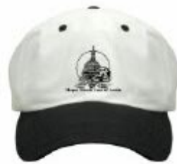
MMCA Ball Cap $14.99