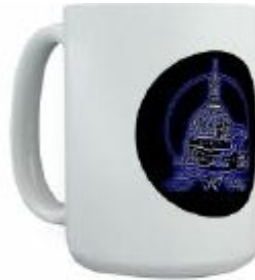
Large Mug Original Price $12.99 Sale Price $9.99!