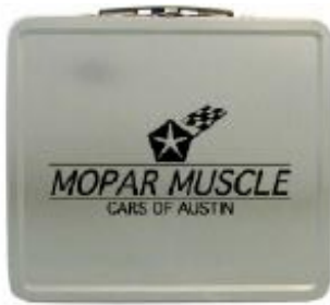
MMCA Lunchbox $15.99