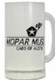
MMCA Frosted Mug Original Price $14.99 Sale Price $11.99!