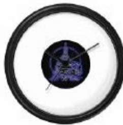
MMCA Wall Clock