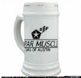
Stein Original Price $14.99 Sale Price $11.99!