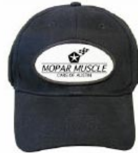
Black Cap $15.99